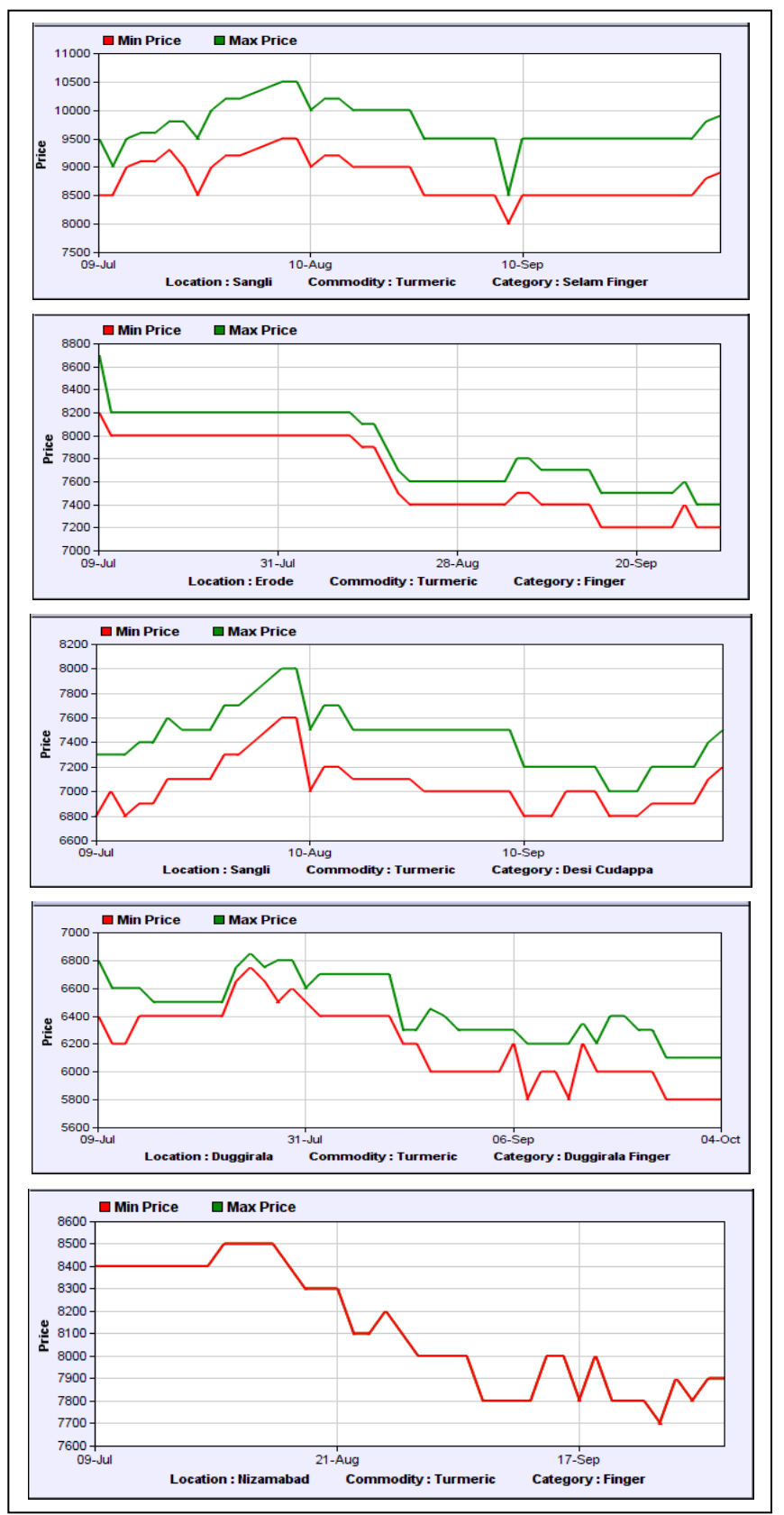
Fig 3: Spot Prices of Turmeric (Finger) in Major Domestic Markets during July – September 2018