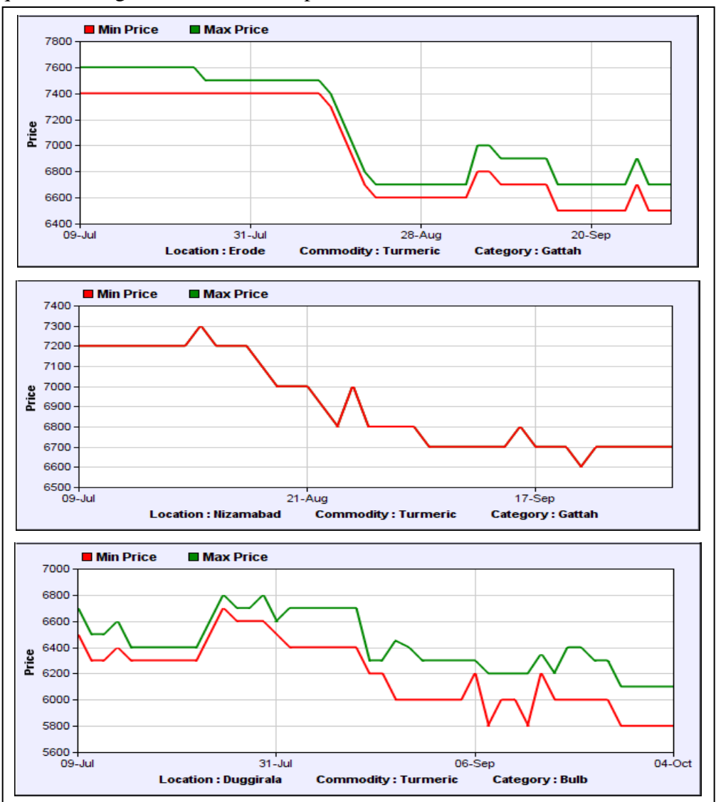
Fig 2: Spot Prices of Turmeric (Bulb) in Major Domestic Markets during July – September 2018

Turmeric prices have shown downward movement from July to September in all major markets. Higher prices reported at Sangli market ranging between Rs. 8500 – Rs. 9500 per quintal (finger) and lower prices recorded at Duggirala market ranging between Rs. 5800 – Rs. 6200 per quintal during the last week of September.