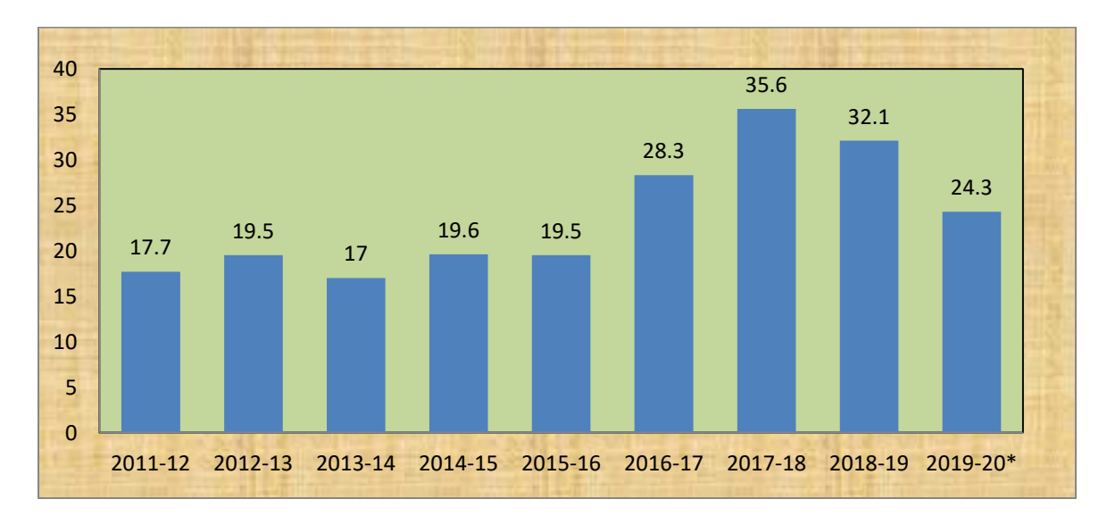
Source: Directorate of Economics and Statistics (DES), *1<sup>st</sup>Advance Estimates

In India during kharif 2019-20, black gram area is 38.82 lakh ha as against 39.56 lakh ha in last year. The states of Madhya Pradesh (16.50 lakh ha), Uttar Pradesh (7.01 lakh ha), Rajasthan (4.60 lakh ha), Maharashtra (2.98 lakh ha), Karnataka (0.69 lakh ha) and Andhra Pradesh (0.09 lakh ha) are the major producers of black gram in India during kharif. In Telangana area coverage under black gram during kharif 2019-20 was 18725 ha and major growing districts are Sangareddy (4407 ha), Vikarabad (3245 ha), Nirmal (3686 ha), Kamareddy (3883 ha), Medak (729 ha) and Adilabad (1254 ha).